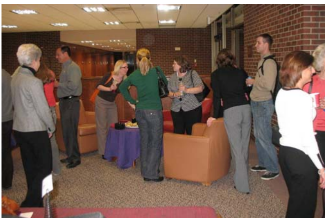
A great time was had by all at the 2007 UCAN BBQ Social